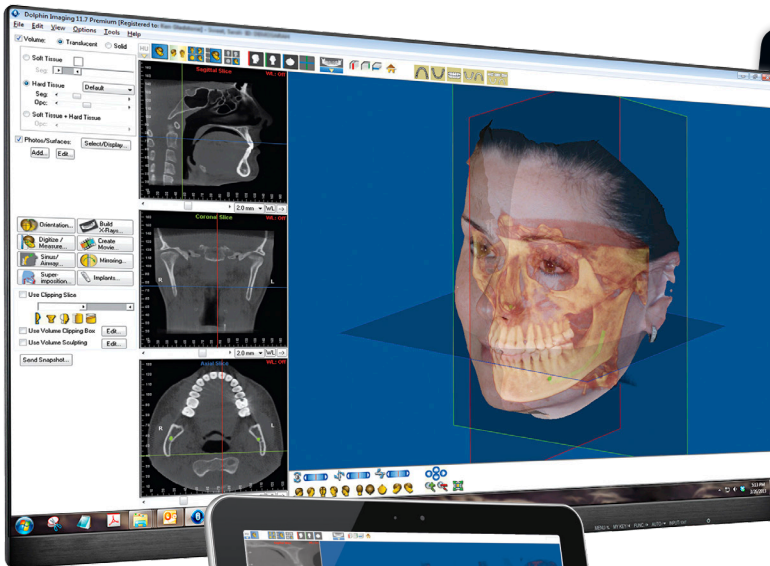
Dolphin 3D on Windows